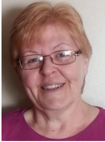
X's and Oh's